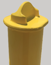
Built in Tie Downs

Available sizes are 4 ft by 8 ft and 4 ft by 18 ft.